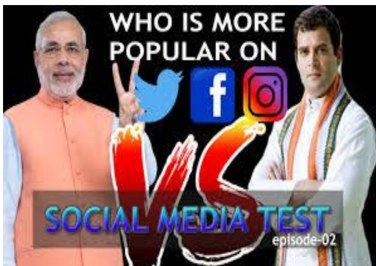
Fig. 4 The figure shows the glimpse of the news channel depicting sentiment comparison of different political leader among masses on twitter

An evaluation of Facebook data during the campaign showed that more than 95% of buzz around a candidate were determined by posts outside of that candidate's primary campaign page. This cycle saw the rise of a more distributed social media presence for both sides. Each candidate had their own primary Facebook page, but many other pages were also formed and sustained for family members, campaign substitutes, and the National Committees of both parties [3, 18, 19]. In the future, we should see more of this expanded but interrelated approach to social media campaigning. Fig. 4 shows the glimpse of the news channel depicting sentiment comparison of different political leader among masses on twitter [3, 14, 15].