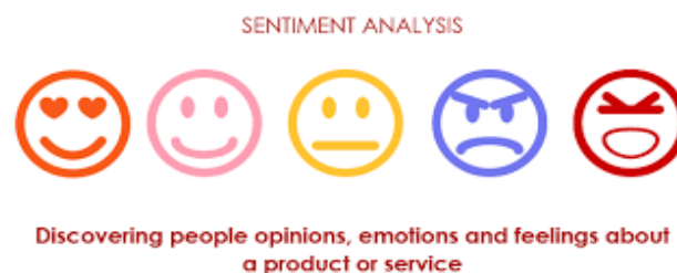
Fig. 1 The figure depicts the classification of sentiments

Some key points to be considered in sentiment analysis are mentioned as under [3, 5].