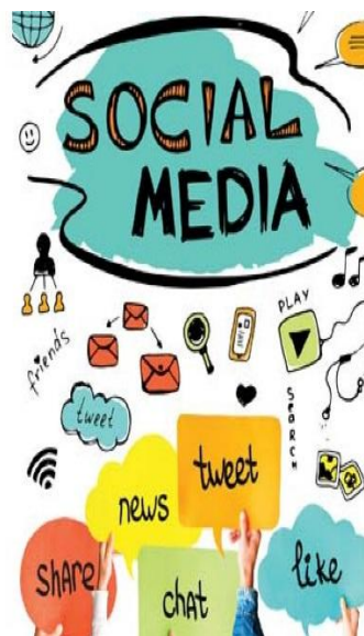
Fig. 3 The figure shows the logos of popular social media sources

The impact of social media on general public in regard with elections is very deep. Fig. 3 shows the logos of the famous social media platforms [3, 16, 17].