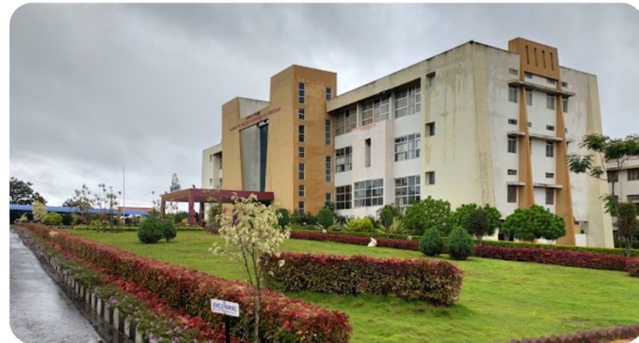
HIRASUGAR INSTITUTE OF TECHNOLOGY, NIDASOSHI

ICRTET-2025 intends to provide a common platform to the Researchers, Academicians, Practitioners, Engineers, Research Scholars, PG, and UG Students in frontline evolutionary and challenging fields. It is expected to share their Knowledge and Research expertise to advance in Emerging Scientific Applications in Engineering and Technology and create a prospective collaboration and networking on various allied ventures.